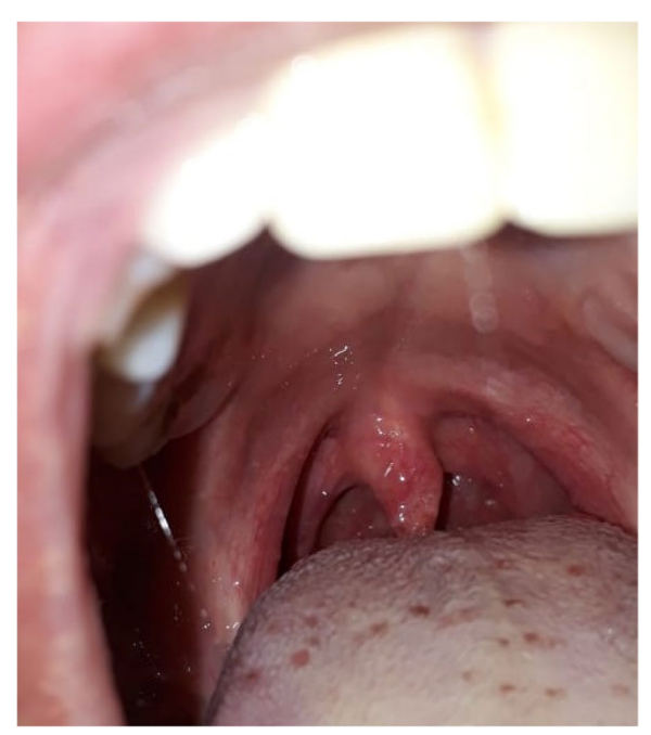
Fig. 1 Grade IV uvular injury (auto-amputated uvula): shortened uvula with irregular border

ETT intubation is performed on millions of patients worldwide everyday with well-documented complications. Postoperative uvular injury is an extremely rare complication of endotracheal intubation with a total of only 53 reported cases found within the literature (Pamnani et al. 2014; Bright et al. 2021). The first ever case was reported in 1978 (Reid et al. 2020). The overall incidence of postoperative uvular injury is only 0.034% making it one of the rarest postoperative complications (Pamnani et al. 2014).