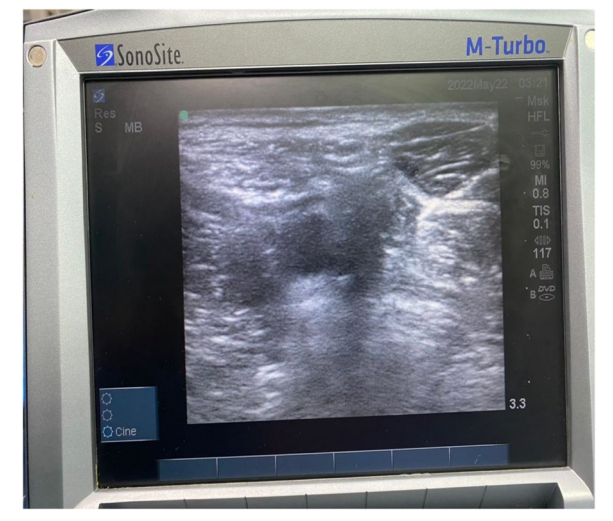
Fig. 3 After injection under guided by ultrasound