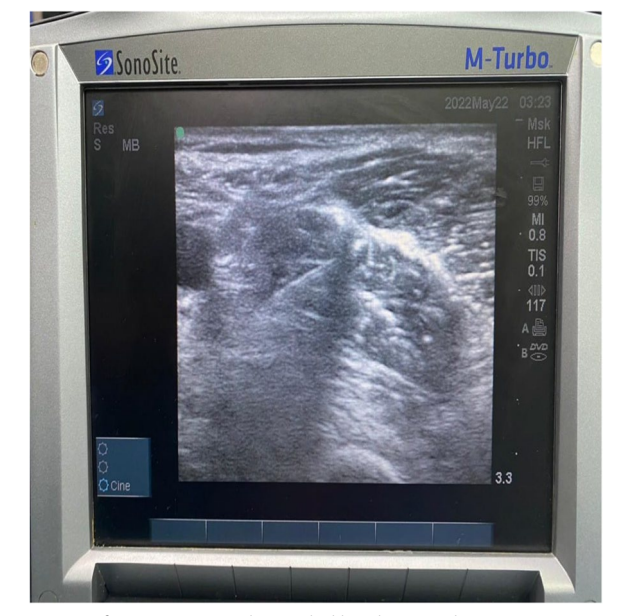
Fig. 2 Before injection under guided by ultrasound

instruments into the knee through the other incisions. The knee problem was repaired or eliminated by the surgeon. The saline was removed from the knee at the conclusion of the procedure (Thompson and Miller 2020).